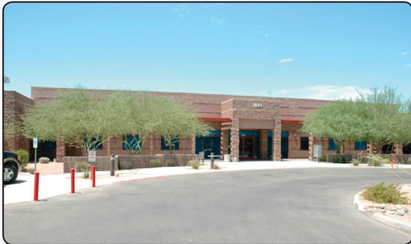
Prime East Valley Medical Office Location for Lease