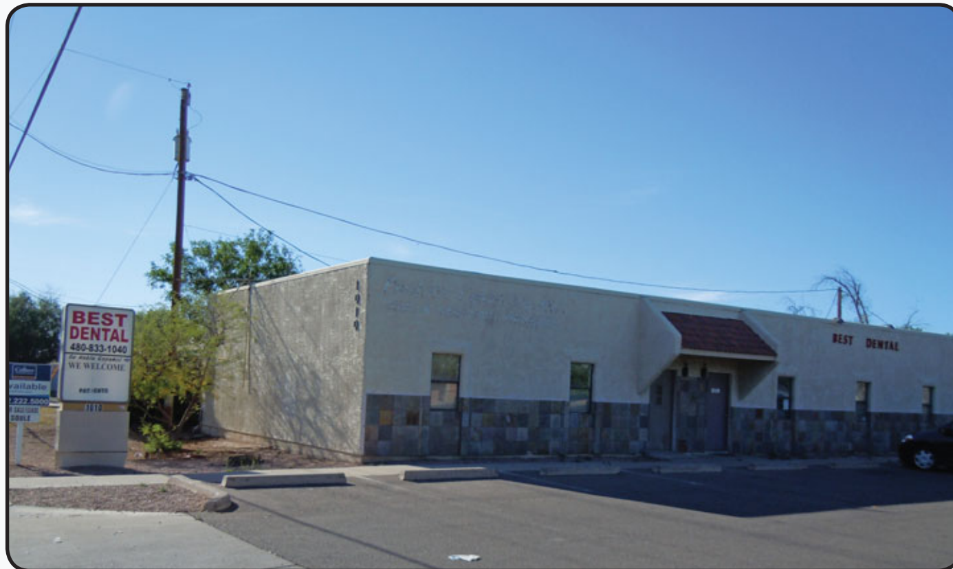
Medical Office Building for Sale or Lease in Mesa