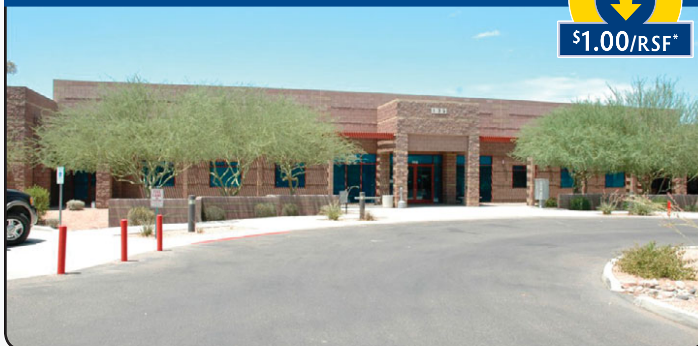
Prime East Valley Medical Office Location for Lease