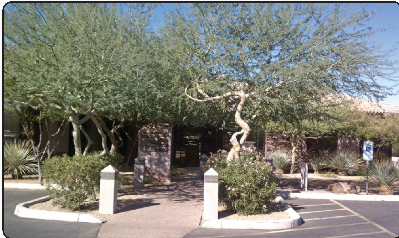
Office Condo for Sale or Lease in Prestigious North Scottsdale Location