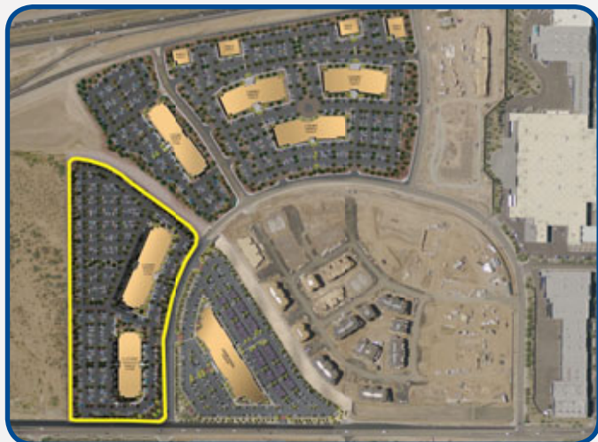
Land for Sale in 62 Acres Employment Campus