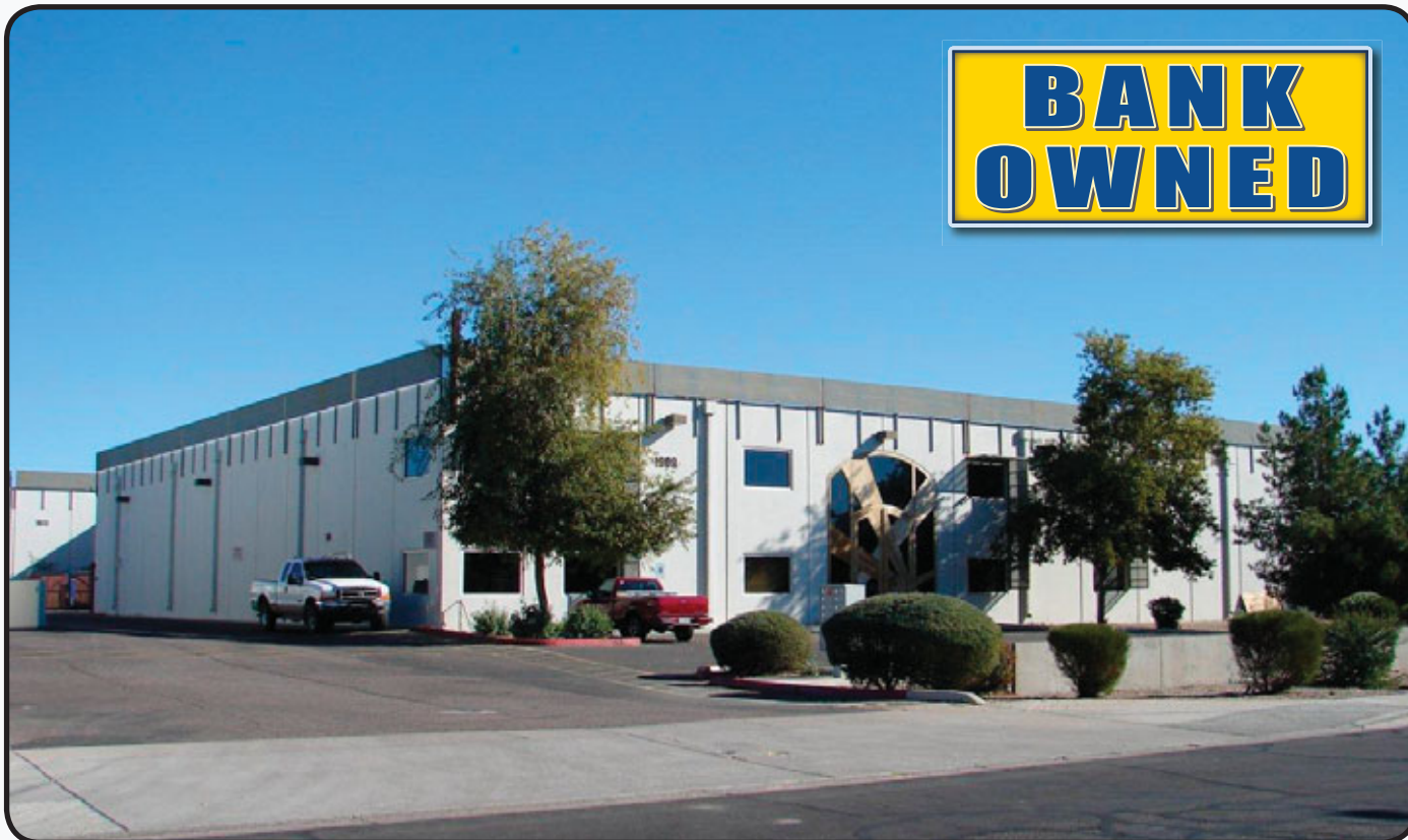
Bank Owned Two Story Industrial/Manufacturing Building for Sale