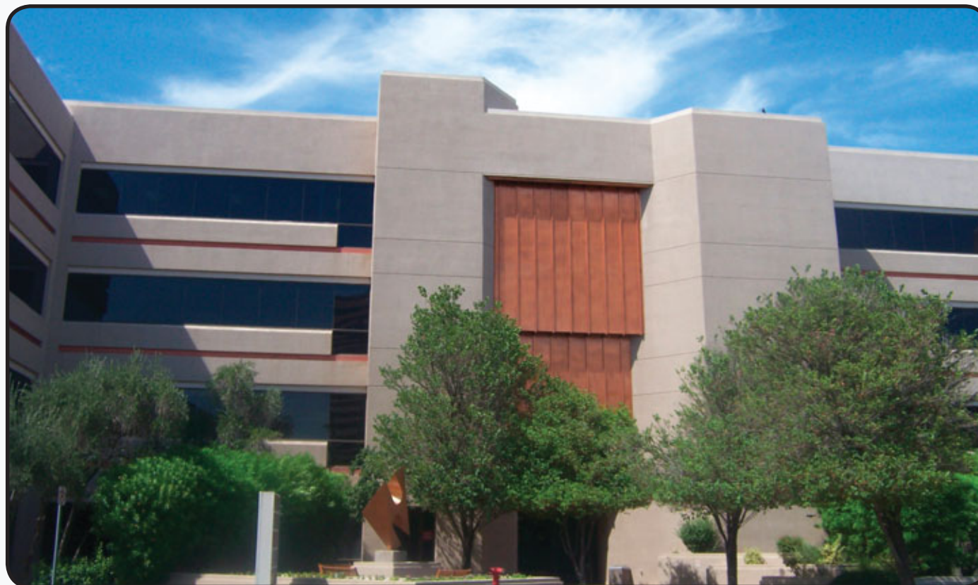
Office Suite for Sale in Central Phoenix

Parking 4:1,000/SF Free Customer Parking