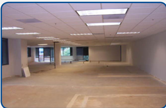
Excellent Downtown Location