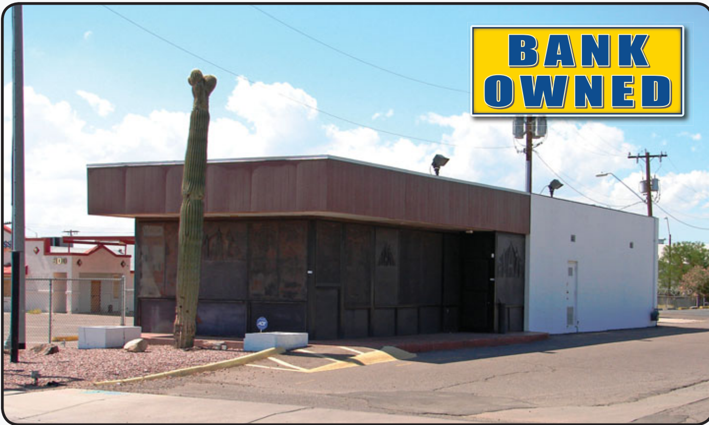
Bank Owned Freestanding Building Close to Sky Harbor International Airport