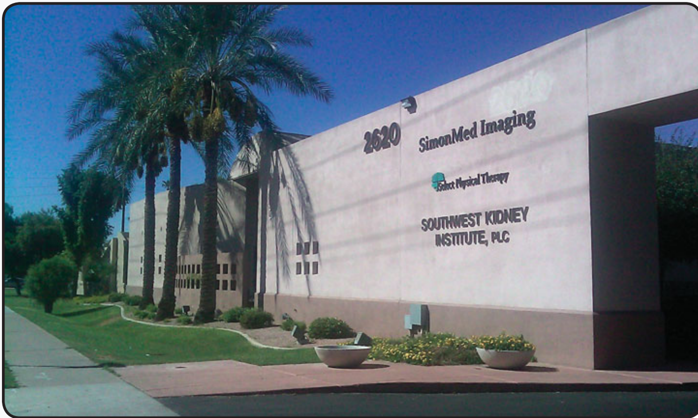
Medical Office for Lease in Central Phoenix Medical Corridor