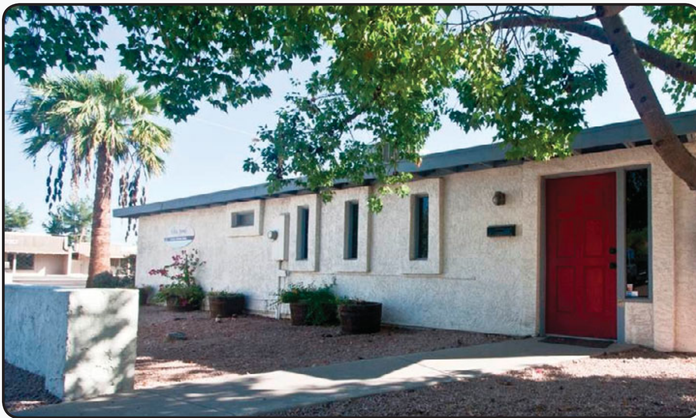
Freestanding Medical Office Building for Sale or Lease in Scottsdale