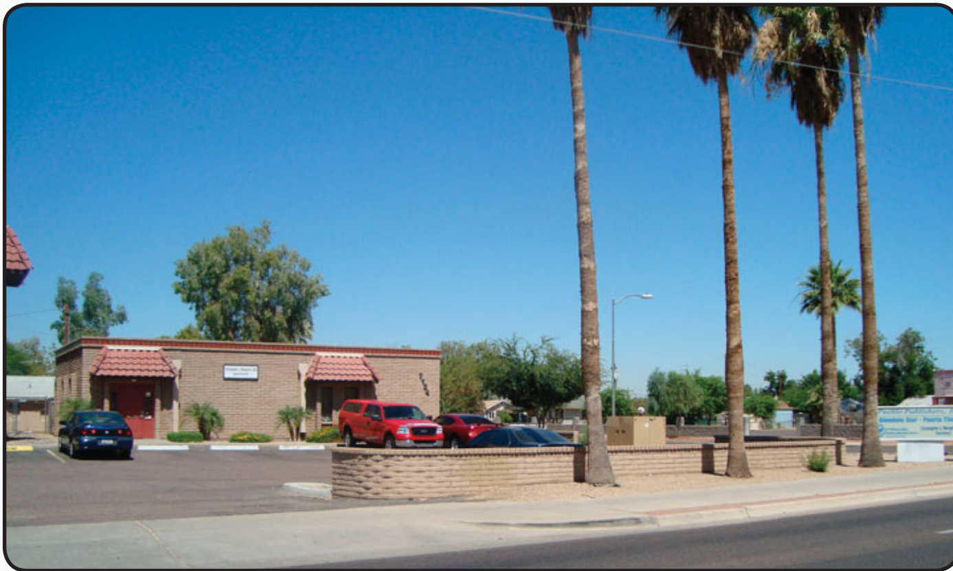
Fully Equipped Dental Office for Sale or Lease in Glendale