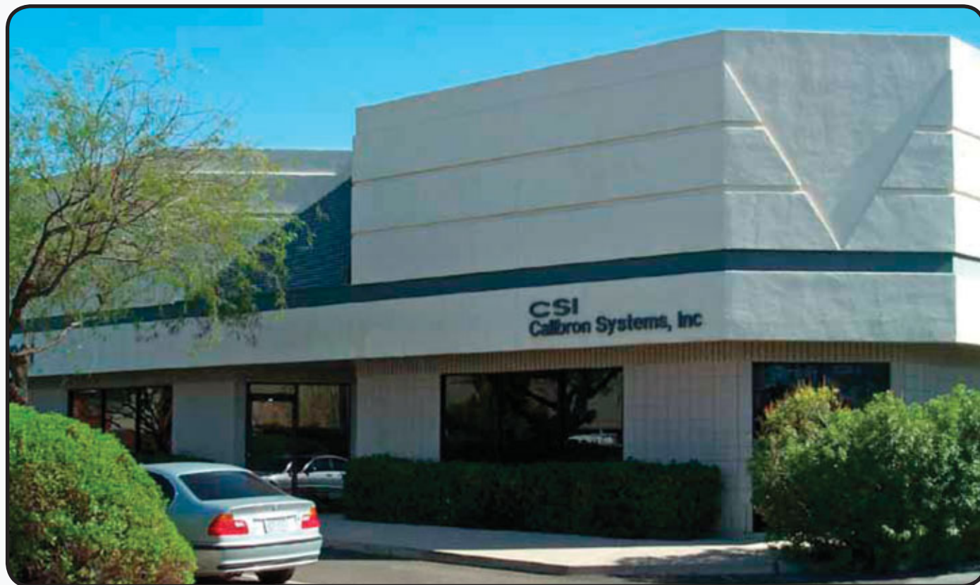
Flex Space for Lease in Scottsdale Airpark Area

76th Street & Gray Road • Scottsdale, AZ