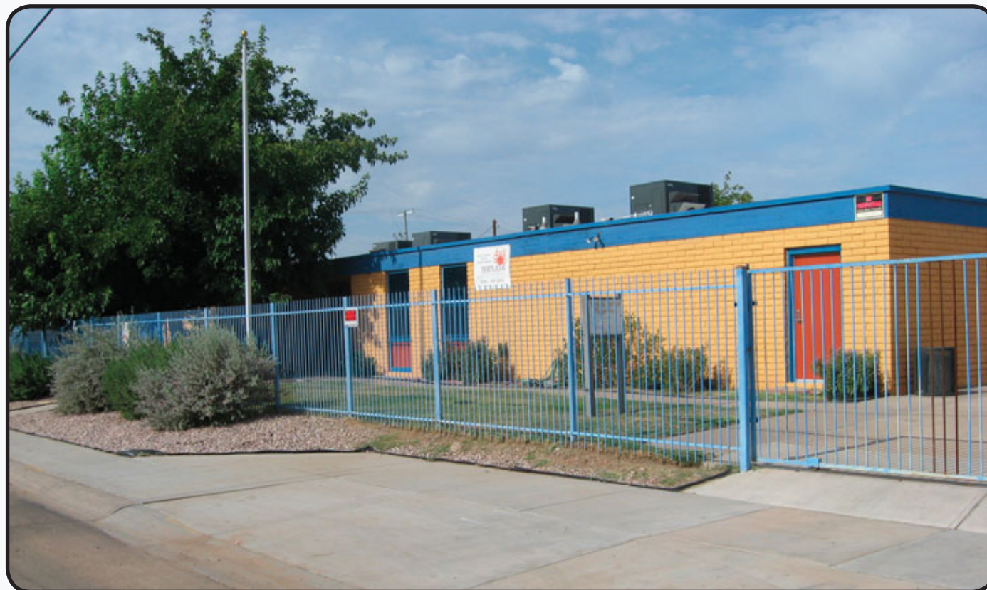
Fully Built-Out School for Sale or Lease in Phoenix