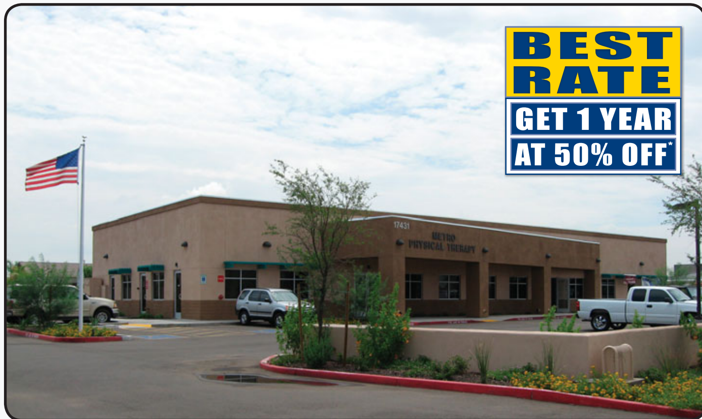
Excellent Access to Valley Markets & Diverse Labor Pool