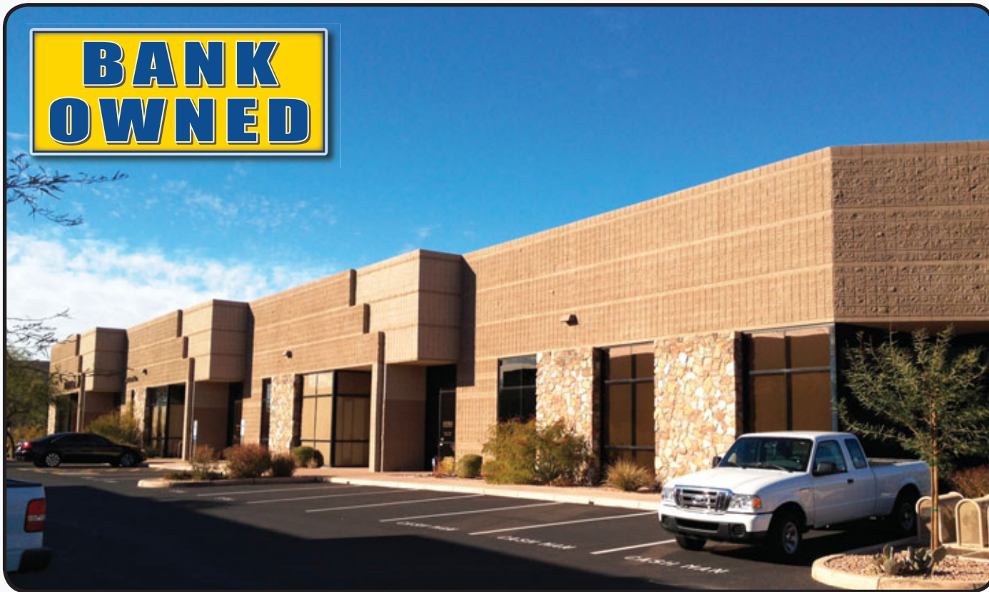
Bank Owned Industrial Condo for Sale or Lease in Prime Scottsdale Location