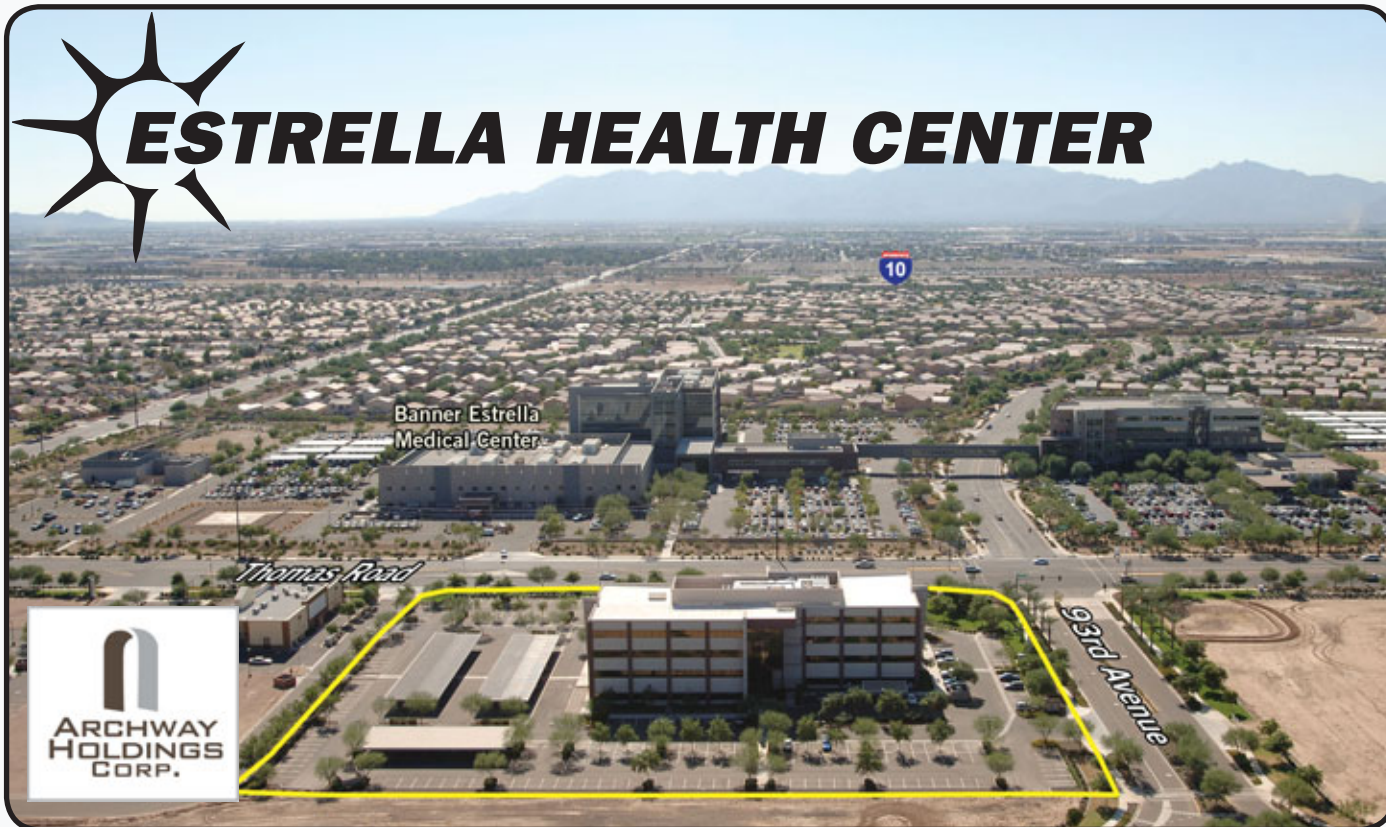
Class A, Four-Story, 80,000 SF Medical Office Center for Lease • Adjacent to Banner Estrella Medical Center

NEW OWNERSHIP! Well Funded & Ready to Deal