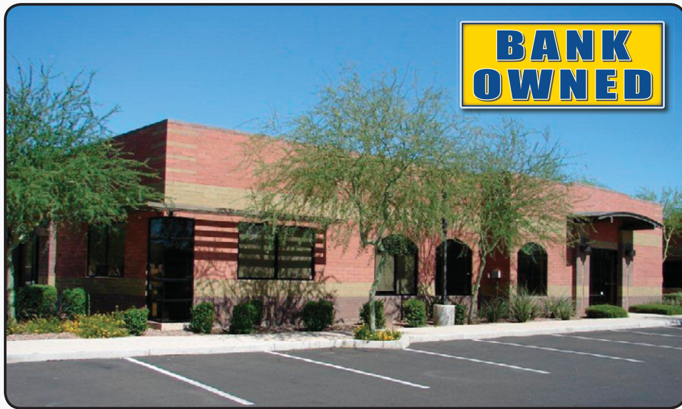
Bank Owned Office Space for Sale in Phoenix