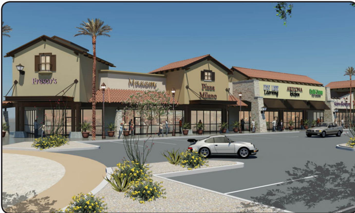
Build to Suit Professional Buildings for Sale or Lease in Growth area of Gilbert