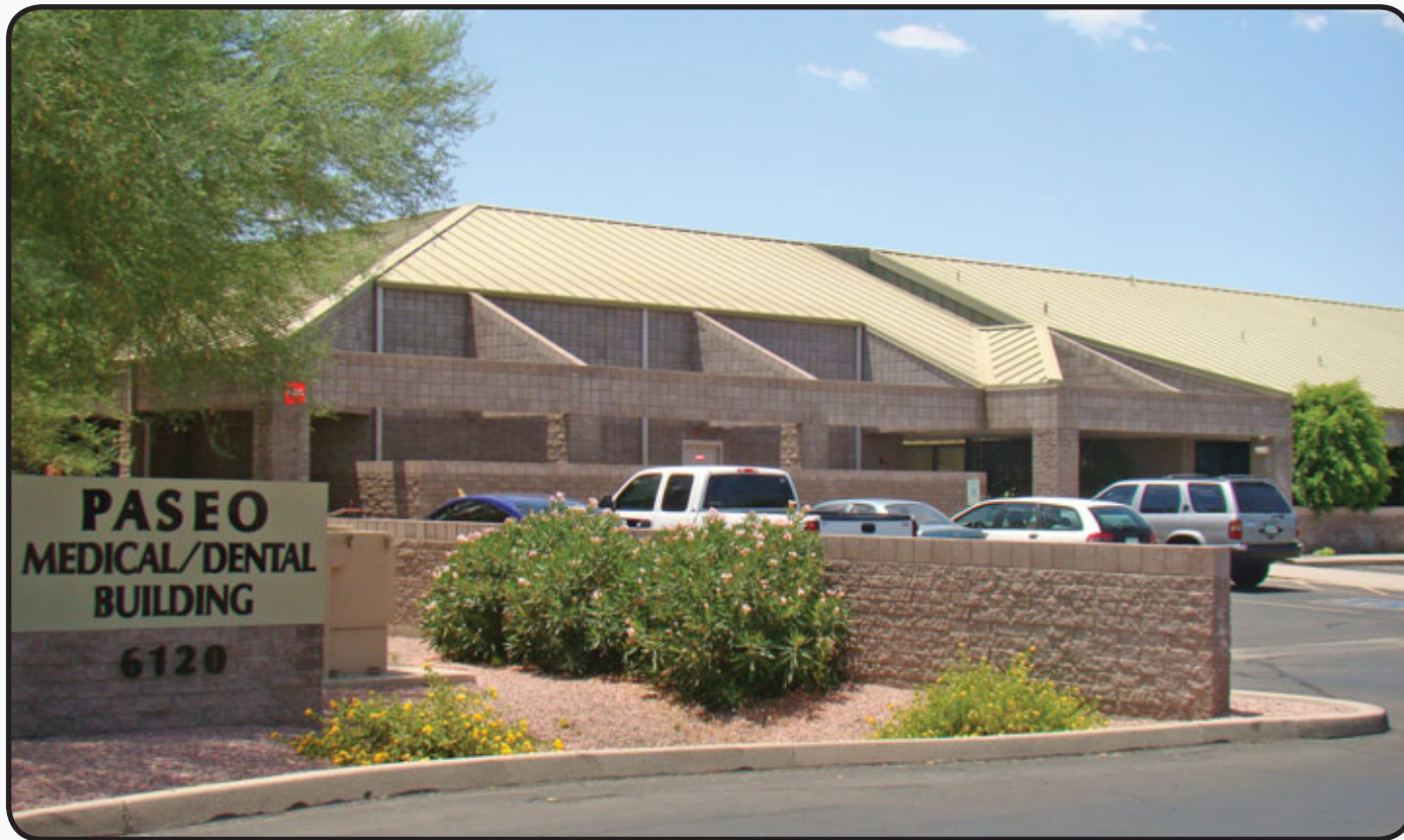
Medical Office Suite for Lease in Glendale, AZ