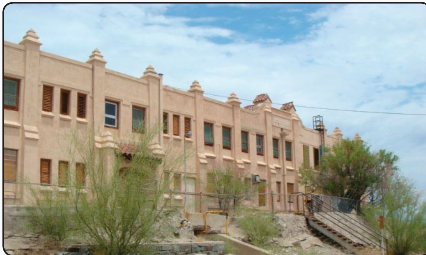
Historic Hospital for Sale in Downtown Ajo, Arizona